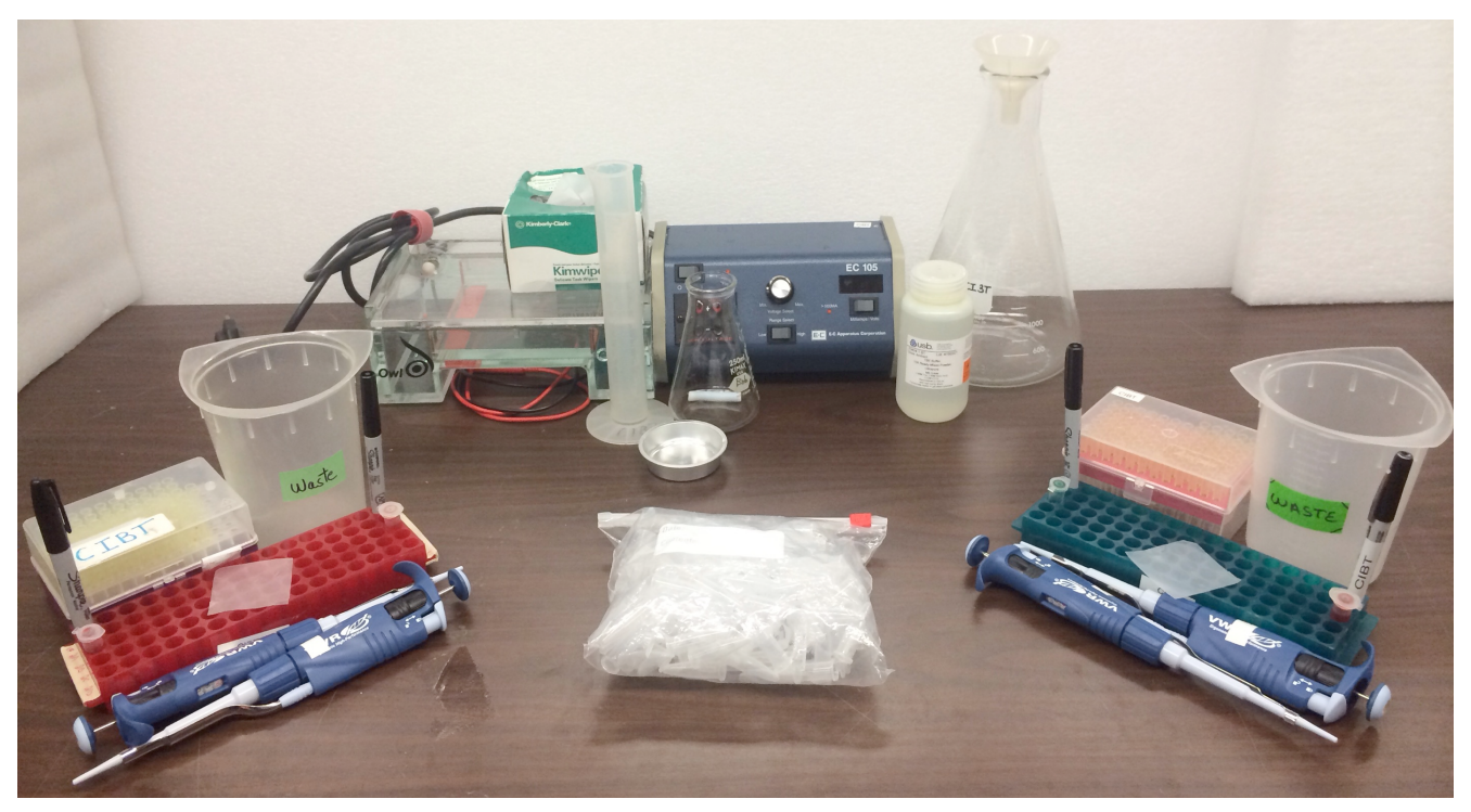
FIGURE 1: One working station, showing materials required by a working group of 4-5 students (divided in two team groups of 2-3 students each).